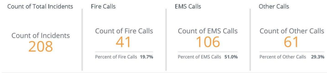
Percentage of Incident Type Group

The Mokelumne Fire District experienced a busy June and July 2024, with a total of 208 calls. This included 41 fire calls, 106 EMS calls, and 61 other types of calls. The district has prepared for an early and active fire season.